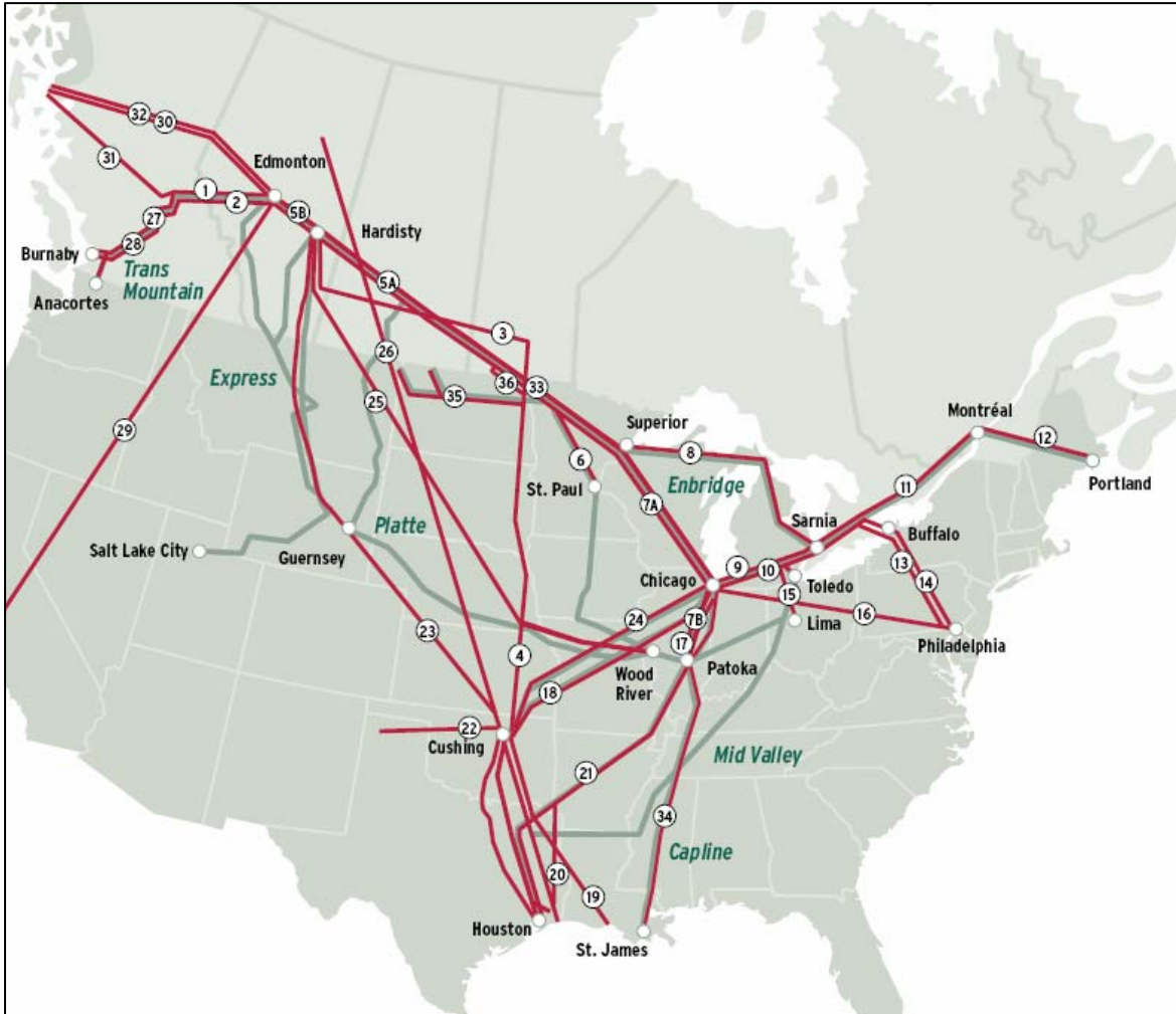
Figure 1: Pipeline Expansions and Proposals