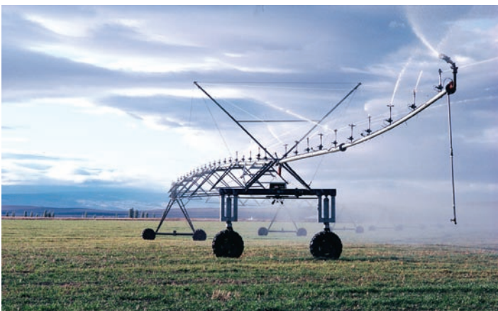
Irrigation is the second largest water user in the United States.