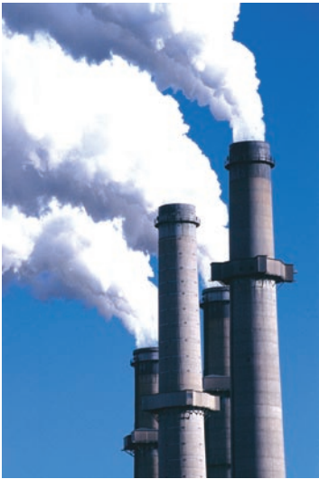
Coal power plant smokestacks emitting steam. In 2002, fossil fuel and nuclear plants withdrew nearly 225 billion gallons of water per day.