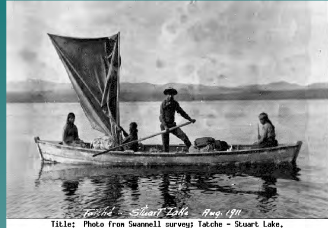
Title: Photo from Swannell survey; Tatche - Stuart Lake.