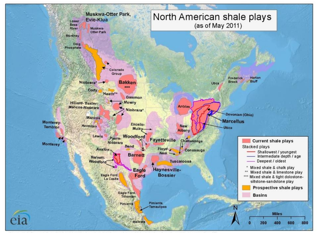
Source: U.S. Energy Information Administration based on data from various published studies. Canada and Mexico plays from ARI. Updated: May 9, 2011

Domestic production of shale gas also has the potential over time to reduce dependence on imported oil for the United States. International shale gas production will increase the diversity of supply for other nations. Both these developments offer important national security benefits.<sup>2</sup>