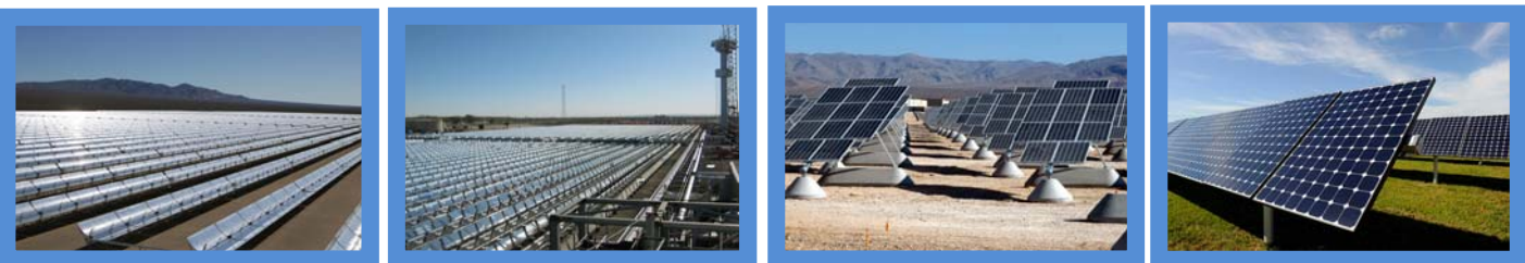
Nevada Solar One

Developer: Acciona Electricity Purchaser: NV Energy Location: Boulder City, NV Technology: Trough Capacity: 64 MW Source: Acciona North America